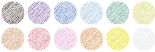
Figure 8: Available colored pencils set.